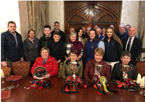
Northern Ireland Branch AGM, Tullyglass House Hotel 11 th November 2017

I would like to thank everyone who has supported our events, shows and sale this year in Northern Ireland. Merry Christmas and a Happy New Year to you all and good luck with the lambing.